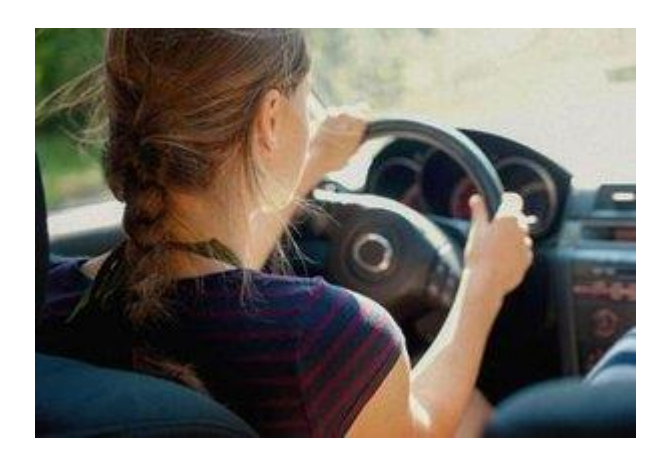
Fewer Teens Want to Drive. It's Changing How They Spend.