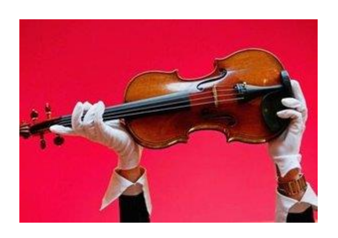
Breaking Up is Hard to Do: How to Handle Collections in Estate Planning